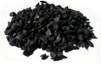
Rubber granulate fill