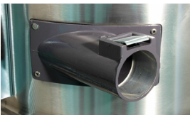
Tangential Suction Inlet, 70mm, Aluminum