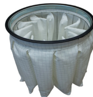
Conductive Star Shaped Filter with Gage for ORDLOC 652 -Included