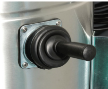
Side Mounted Manual Filter Shaker