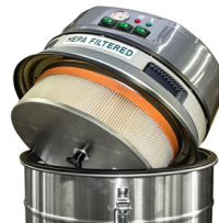
HEPA Filter Cartridge - Included